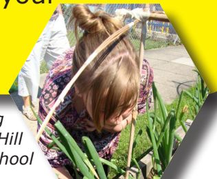
Veg picking at Carlton Hill Primary School